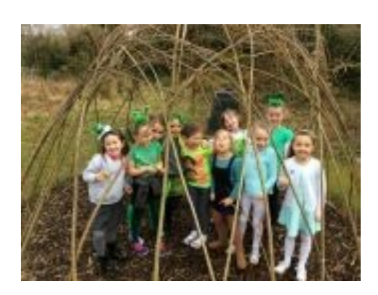
Anti Litter Campaign

Our whole school has worked really hard to raise awareness of the dangers litter can cause to the environment and especially our school grounds. Everyone in our school is now included in our daily litter picks. We also took part in a colouring in & poster competition to inform the children how important it is not to be a litter bug. Thank you to all children at Holy Family.